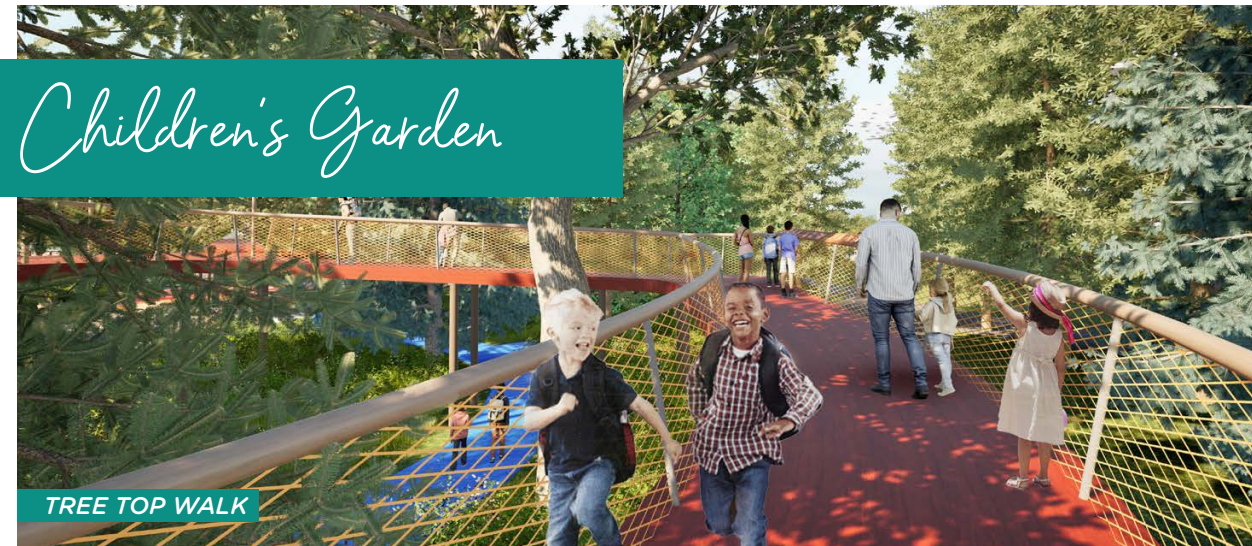
TREE TOP WALK